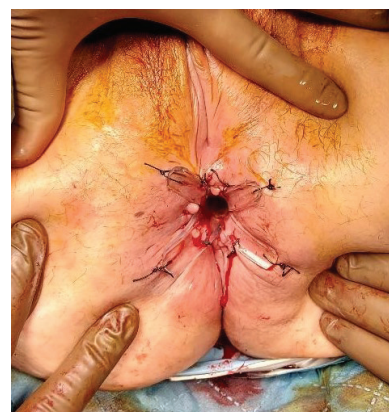
Figure 3. The Placement of the Stent

The current treatments of stricture after ISR are dilatation via Hegar dilators, endoscopic balloons, and surgical procedures including flaps, stricturoplasty, or permanent ostomy. 7 Hegar dilatation may cause complications such as bowel perforation, anastomotic rupture, and perirectal abscess after dilatation procedures, and further surgical intervention may be required 4 because the recurrence rate after dilatation is high within short periods. Therefore, in this study, we attempted to maintain the dilatation longer using a stent in combination with dilatation during a single surgery. The patient was receiving adjuvant chemotherapy, which made us hesitate to perform flap surgery. In addition, the patient refused a colostomy. As such, our options were limited.