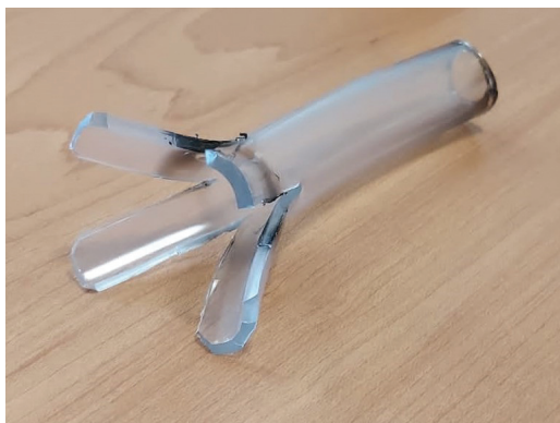
Figure 2. The Stent

Oral feeding began on postoperative day 1, and defecation through the tube occurred on postoperative day 2. The patient was discharged on the third day following surgery. During the 2 weeks of follow up, the patient did not report any challenges in terms of mobilization and lifestyle. There was no bleeding. However, tenesmus was described before removing the stent. After removal of the tube, the stricture was resolved, and the patient's defecation was normal. Since the patient rejected a colostomy, the only option was stricturoplasty. However, this was not suitable because it could interrupt the planned chemotherapy. Therefore, we thought of another minimally invasive solution, and the patient was very satisfied with the outcome of the procedure. The pouch was significantly smaller than before. After a follow-up period of 10 months, no problems regarding defecation were reported, and the pouch disappeared.