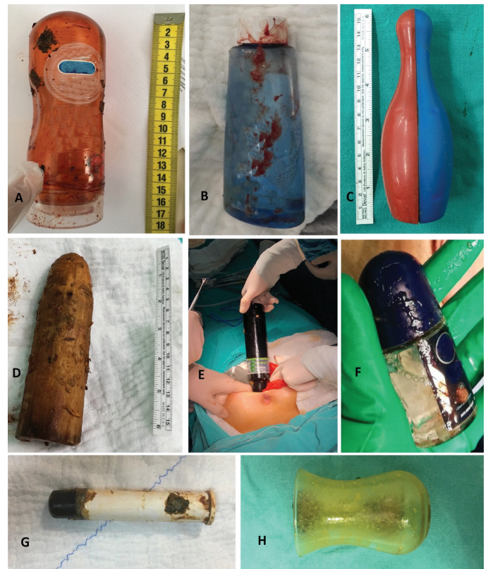
Figure 2. a) Lubricant gel bottle, b) Perfume bottle, c) Plastic bowling pin, d) Piece of wood, e) Bottle of black seed oil, and f) Roll-on deodorant bottle

Surgeons and emergency physicians frequently encounter foreign bodies in the rectum. These objects vary widely, but the vast majority are sex toys, bottles, vegetables and