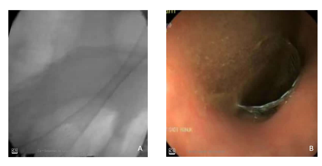
Figure 1. Confirmation of stent patency by fluoroscopy and colonoscopy (A: Fluoroscopy view, B: Colonoscopy view)

Colectomy was performed by first trying the laparoscopic approach in all patients with clinical success in bowel decompression. If surgeons doubted the integrity and safety of the anastomosis during the peroperative period,