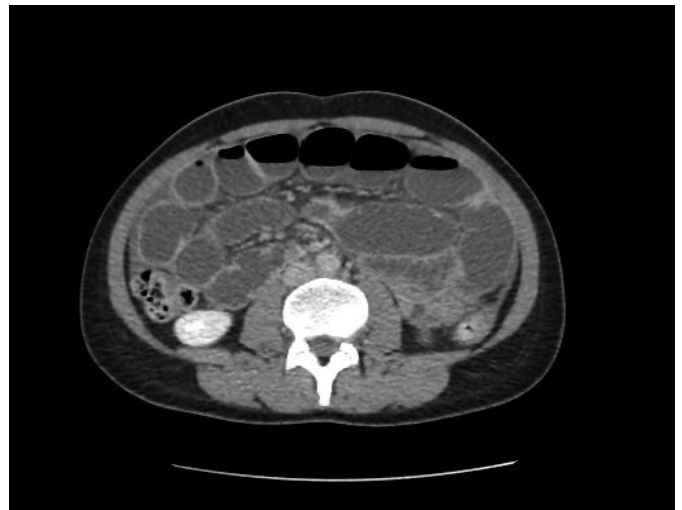
Figure 2. Abdominal CT CT: Computed tomography

There are many causes of mechanical small-bowel obstruction. Ninety percent of obstructions without peritonitis resolve