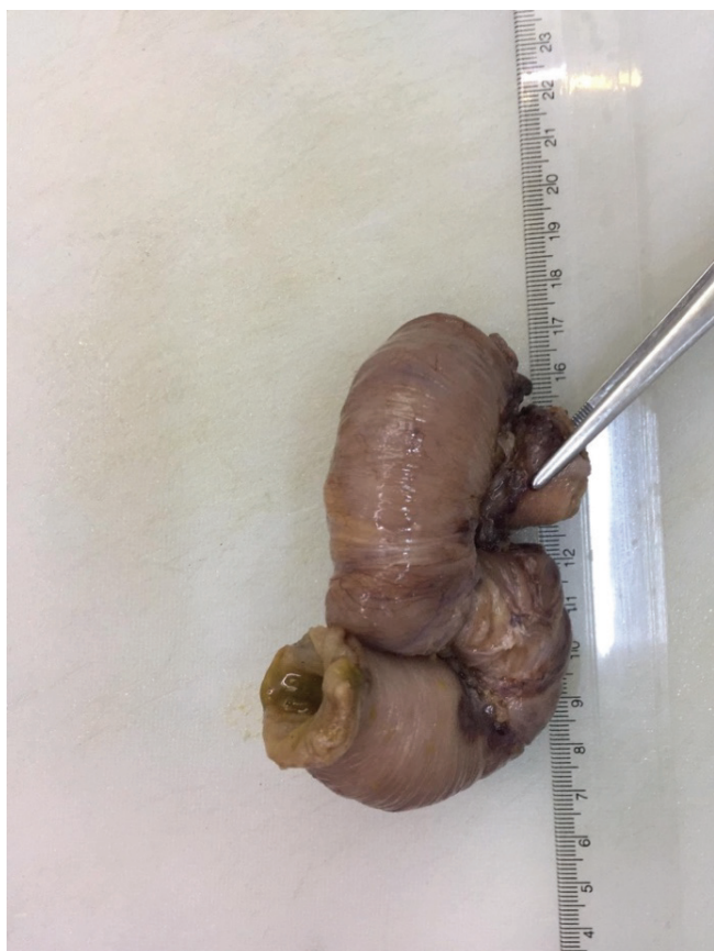
Figure 4. Macroscopic image of the Specimen