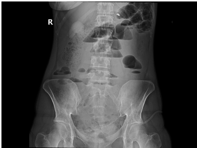
Figure 1. Plain Abdominal X-ray

A 28-year-old female patient was admitted to the emergency service with complaints of abdominal pain, loss of appetite, nausea and vomiting. The abdominal pain started in the epigastric region one day ago and radiated to the whole abdomen in 6 h. The character of the pain was crampy and lasted for ~1 min, then gradually decreased. She had no remarkable past medical history. In the physical examination, abdominal tenderness in the whole abdomen and rebound tenderness were positive. The lab test showed mild leukocytosis. Abdominal USG was inconclusive because of gas. Plain abdominal X-ray showed multiple air-fluid images (Figure 1). IV contrasted tomography showed dilatation and wall thickening of the whole ileum (Figure