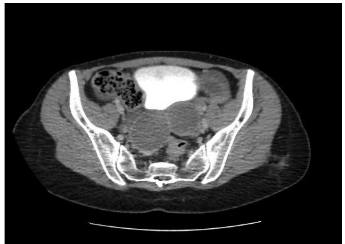
Figure 3. Abdominal CT CT: Computed tomography