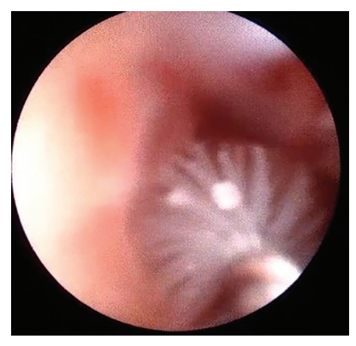
Figure 3. Removing remaining hair and debris

Forty eight patients under the age of 18 years who were operated for PS disease in Muş provincial hospital were examined. The mean age of the patients was 16.18±1.16 (12-