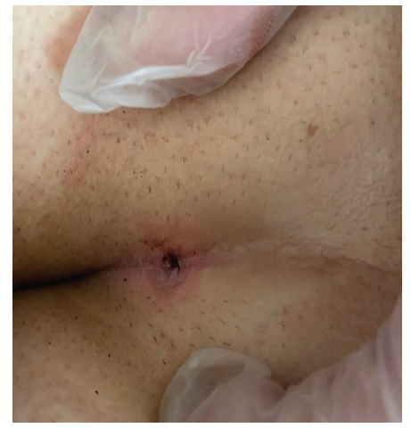
Figure 5. 7th day after surgery

18) years, 20 (41.6%) of the patients were male, 28 (58.3%) were female. The length of stay in the hospital was 3.48±1.9 days. The average follow-up period was 480±196 days (54-780). The time to return to work was 10.6±8 (3-28) days. Forty eight patients were operated, including 26 with EPSIT method, 13 with Limberg flap method and 9 with primary closure. The recurrence and minor complication rate in the EPSIT method was 4 (15.3%), the recurrence and minor complication rate was 1 (7.6%) in the Limberg method, and 1 (11.1%) patient operated with the primary closure method had recurrence (Table 1).