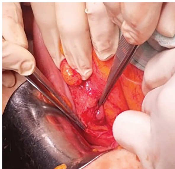
Figure 4. Perforation area in the antimesenteric area in the colon