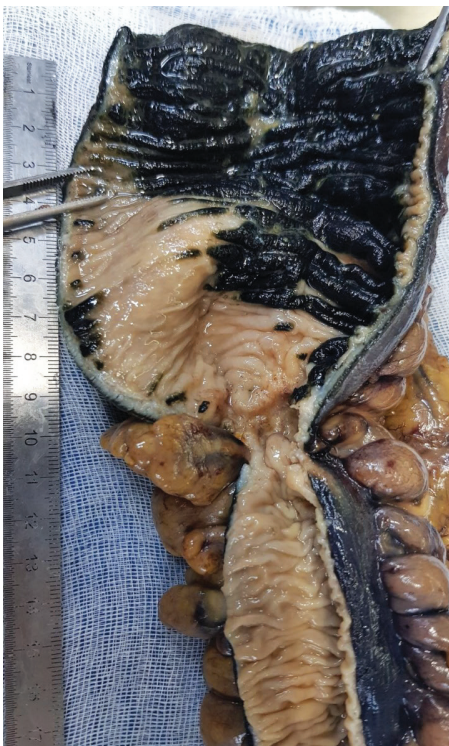
Figure 1. Tumor tissue and diffuse black-brown mucosa proximal to tumor tissue