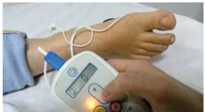
Figure 1. The nerve stimulation device and inserted needle

The PI (Gatekeeper ® ) treatment was also performed as an outpatient procedure. Under mild anesthesia, the patients were placed in the lithotomy position. Before the injection, all patients received fleet enemas and 1 g of intravenous ampicillin sulbactam for prophylaxis. After the perianal area was cleaned with an antiseptic solution, four small incisions were performed at 3, 6, 9 and 12 o'clock 2 cm beyond the anal verge (Figure 2). Then, the introducer, which is composed of a metal guide and the prosthesis, was inserted