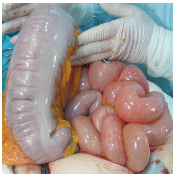
Figure 3. Massive dilatation of the cecum and distal small intestinal segments.

The patient has been followed for one year without any complaint.