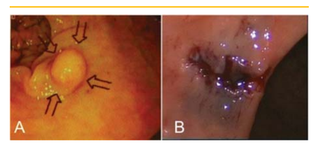
Figure 1. A) Appearance of the polyp before snare polypectomy; B) India ink dye of the remnant lesion.

The blood of gastrin was 1400 pg/ml. Octreotide scintigraphy was negative. Upper gastrointestinal system endoscopy, pancreas, thyroid ultrasonography and function tests was entirely normal. Multiple endocrine neplasia was excluded according to these findings. A metastatic work-up was performed, including chest X-